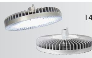
141 Durosite LED High Bays installed inside