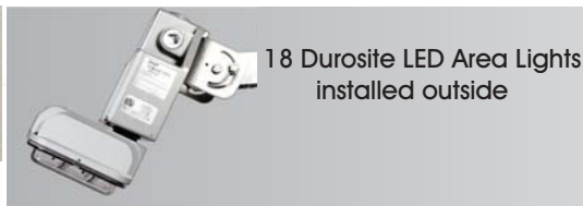
18 Durosite LED Area Lights installed outside