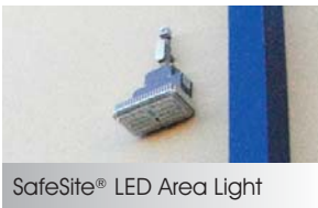
SafeSite® LED Area Light